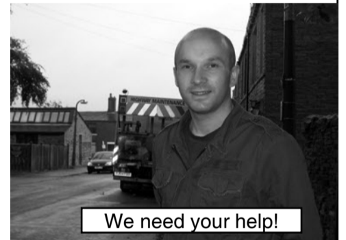
We need your help!